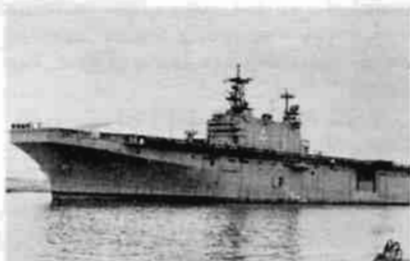
USS NASSAU (LHA-4) arrives at the shipyard.

NASSAU will be berthed at Pier 3 in the shipyard for the remainder of the ten-month yard period and the NASSAU crew is adjusting to shipyard life. Many NASSAU sailors are using this period to attend various Navy training schools and to take high school completion and college courses.