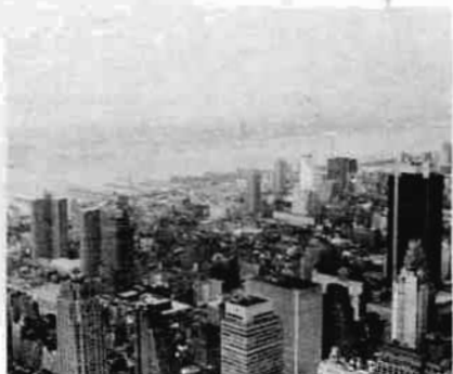
This photo taken from the Empire State building shows NASSAU dwarfed by New York's many tall buildings.

An open house was held that Saturday and over 5,000 visitors toured the NASSAU during the four hours that tours were conducted. Many of the visitors were amazed at NASSAU's size and complexity.