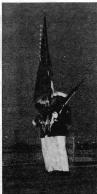
Members of the Marine Honor Guard during the ceremony.